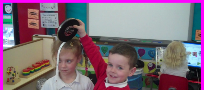
We had fun measuring each other!