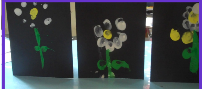
We made daisies with our fingers

Next week we will be looking at what it would be like to be a postman!