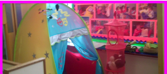
Come and see our Sensory Area!